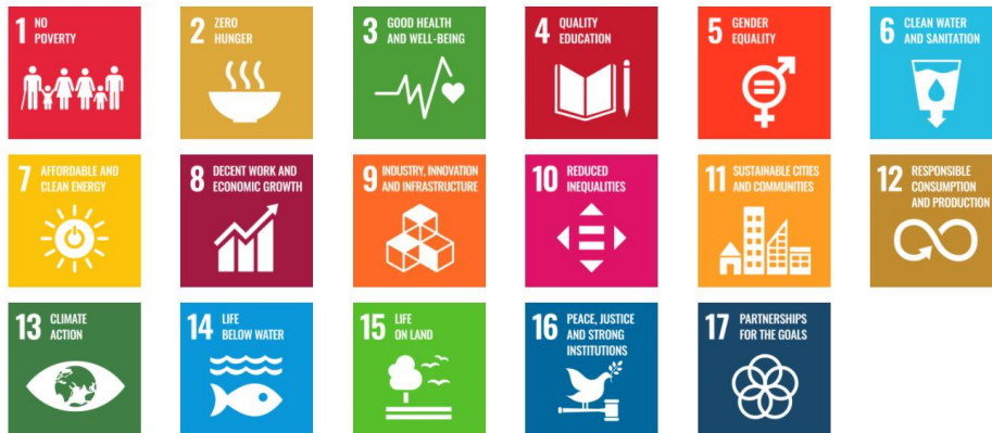
Diagram 1: United Nations Sustainable Development Goals

To assess alignment of companies to the SDGs, we reference an analysis tool developed by an external sustainability expert. Using this tool, we assess the contribution of company's products and services towards advancement of the SDG's, mapping each line of revenue to the 17 SDG's and underlying targets.